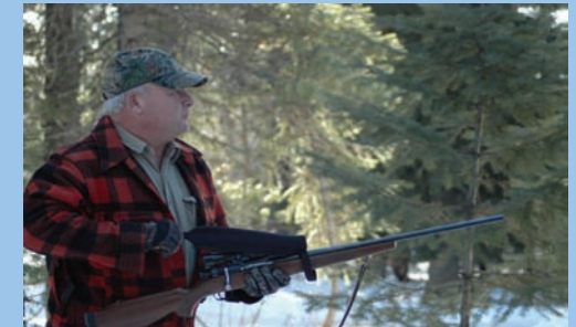
Release Tab and Forget About It!